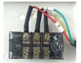
Remote alarm contact