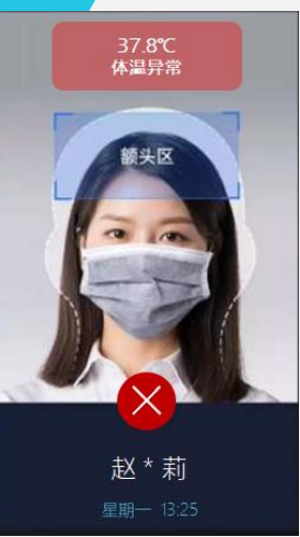
Abnorm al Temp