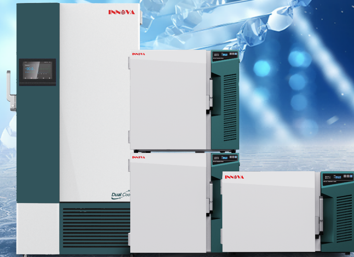
MF-86V838TDV MF-86V128V+MF-86V75V MF-86V75V

This product is designed for use in various sectors, including clinical, pharmaceutical, scientific research, and quarantine departments, for the preservation of items under low temperatures. Additionally, it is suitable for blood stations, hospitals, disease control and prevention centers, scientific research institutions, electronic chemical engineering labs, biomedical engineering research facilities, ocean fishing companies, and more, for the preservation of red blood cells, white blood cells, viruses, bacteria, skin, skeletons, semen, biological products, electronic devices, and specialized materials at low temperatures.