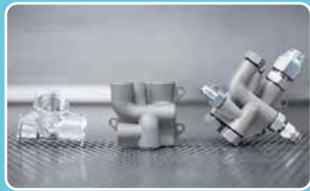
3D printer accessories