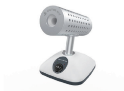
Infrared Sterilizer (option)