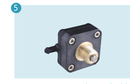
Innovative pressure device, double safety protection