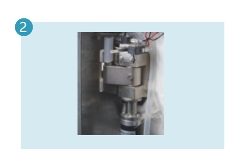
Smart sensitive automatic door system