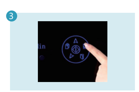
Big size LCD Touch screen control