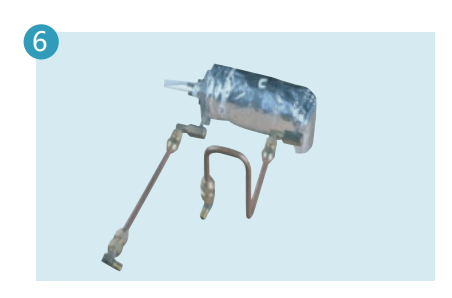
Metal Pipe, high temp-tolerated, more reliable and durable.